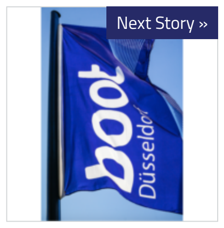
boot Düsseldorf 2021 says it's well positioned for January